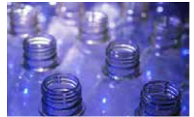
RECYCLING OF PLASTICS