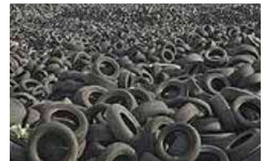
STORAGE OF TIRES